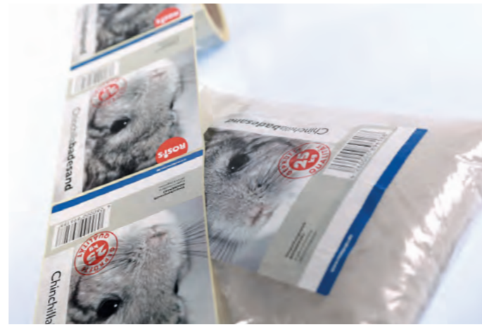
Self-adhesive display label for animal supplies

Companies from all sectors of industry have for more than 30 years put their trust in Weber Marking Systems labelling competency.