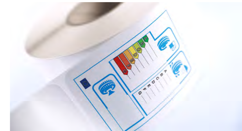
Self-adhesive label with special adhesive for labelling of tyres

We can offer you numerous labelling solutions to perfectly match your application. Label materials and adhesives are constantly improving through our innovations. Talk to us – we know the market better than most!