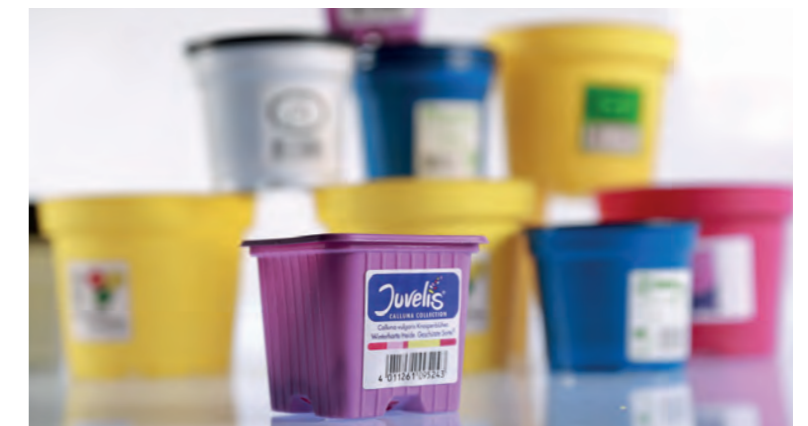
Self-adhesive identification labels for gardening