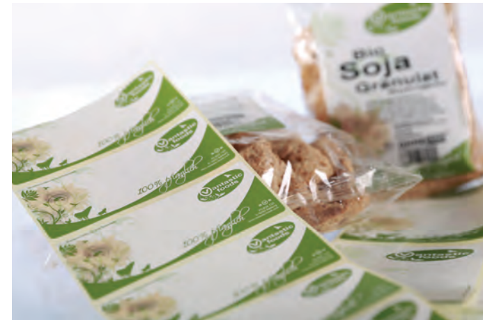
Self-adhesive pre-printed labels for bio products