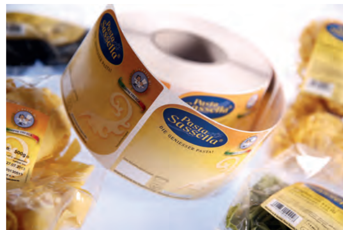
Self-adhesive shape-punched label for pasta