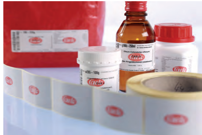
Self-adhesive pre-printed label for health products