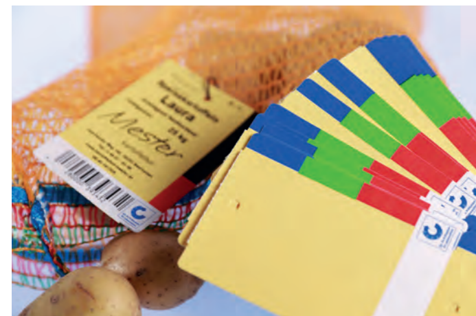
Cardboard tag for fruit and vegetables