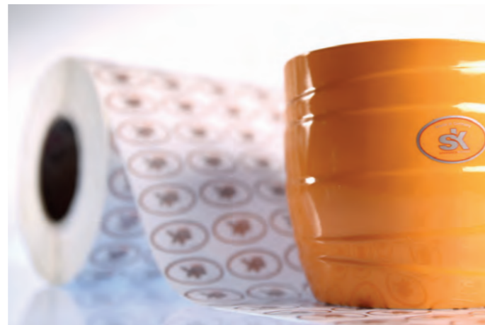
Self-adhesive brand label for ceramics