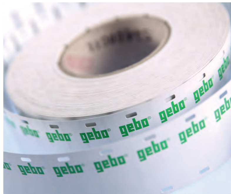
Special and safety labels

Industry needs labels with frequently changing text and with colours to attract additional attention or to signal warnings, e.g. in the chemical industry. This is where pre-printed colour labels are used. We produce top quality, pre-printed colour labels for any application – also partially printed as required, e.g. showing the company logo. Customised printing will follow later, possibly with variable data such as serial numbers, descriptions, weight info, ingredients etc.